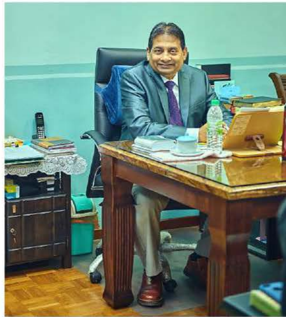
Pastor at the parsonage in John Bunyan House, Johor Baru, Malaysia, during the December Conference 2019 AD

Blessed is the man that walketh not in the counsel of the ungodly, nor standeth in the way of sinners, nor sitteth in the seat of the scornful. But his delight is in the law of the LORD; and in His law doth he meditate day and night. And he shall be like a tree planted by the rivers of water, that bringeth forth his fruit in his season; his leaf also shall not wither; and whatsoever he doeth shall prosper.