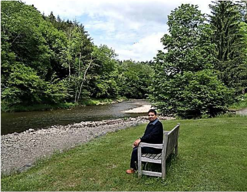
By the rivers of water at Livingston Manor, pastor's favourite route to Andes, NY, USA.